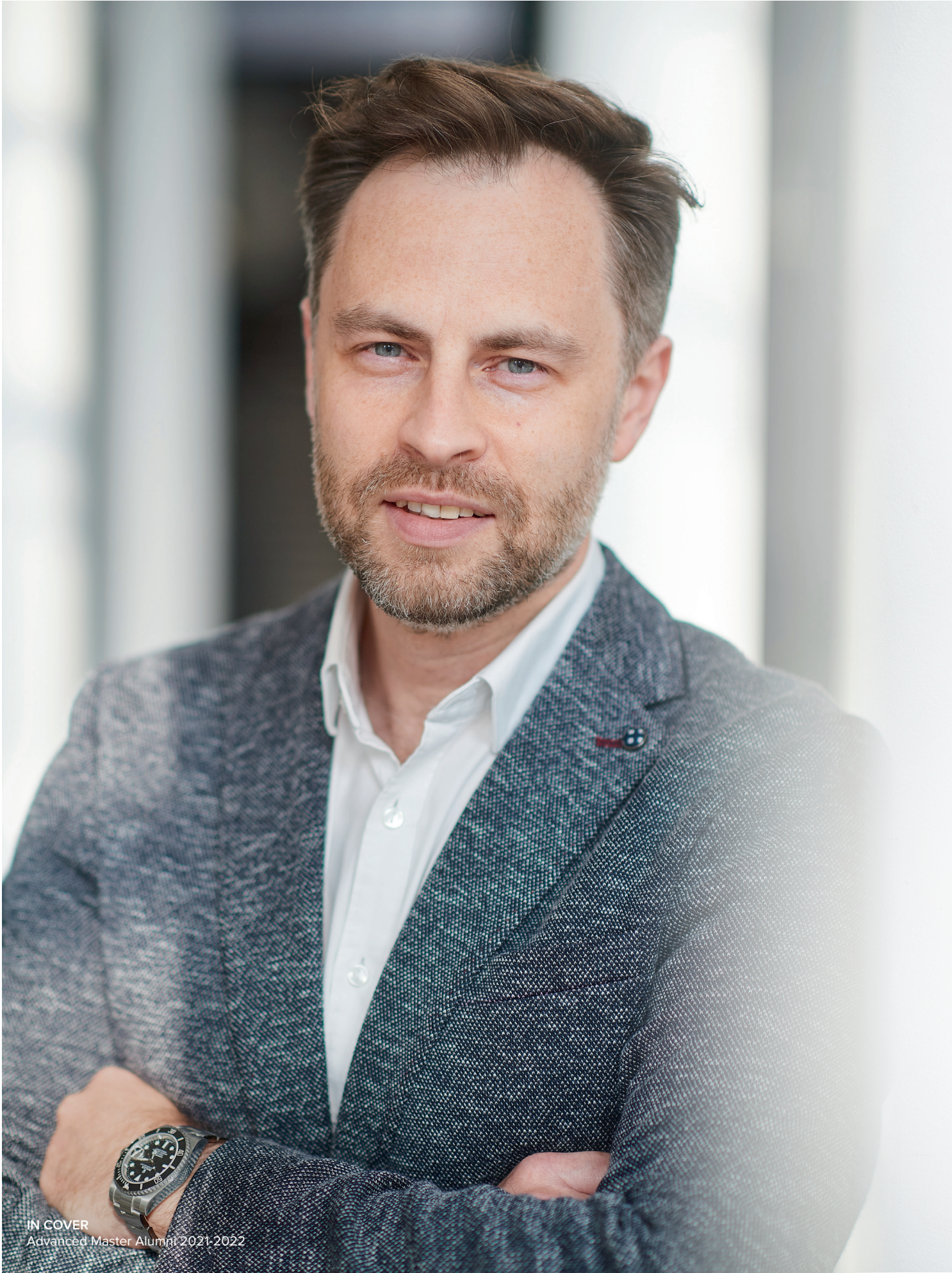
IN COVER Advanced Master Alumni 2021-2022